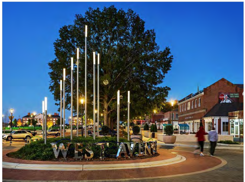
Kannapolis West Avenue streetscape improvement project

The 2050 MTP includes updates to all chapters of the document with new information on the Federal Infrastructure Investment and Jobs Act (IIJA) as well as new NCDOT Complete Streets guidance for locals. For the first time, the MPO performed additional analysis of the Existing and Future Conditions of the Cabarrus Rowan MPO roadways with a more in depth study of the facilities over capacity in the base and 2050 horizon year. Peak hour travel congestion for the 2050 horizon year of all existing and committed projects provided a snapshot highlighting areas of concern for improvements, which was integrated into the Congestion Management analysis chapter. In addition, the MPO unveiled a new detailed study of roadway safety analysis including hot spot and bicycle and pedestrian crash data throughout the MPO area by US Census block. The final 2050 MTP is available on the MPO website at www.crmppo.org .