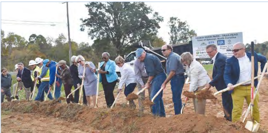
Yadkin River Trailhead project groundbreaking on October 17, 2022

Initially envisioned as a pedestrian connection from a planned greenway system along Grants Creek, into downtown Spencer, and then out to the Yadkin River at the Wilcox Bridge, the STIP project EB-5861 was visionary. With completion of some nodes, the EB-5861 “link” has been refined to tie various important points of interest including three public schools located in northern Rowan, important commercial and recreational development around the Wilcox Bridge at the Yadkin River, and will leverage the value of any single point of interest into what will become a regional attraction. EB-5861 would also extend trails from the 7th Street Trailhead, along Grants Creek and connect to the City of Salisbury’s existing greenway system west of Old Mocksville Road. In its initial planning phases started almost a decade ago, EB-5861 was funded at approximately $3.5 million with the Town providing a 20% local match. That cost did not include right-of-way acquisition, design and engineering, or project management expenses. Today’s cost estimates have grown dramatically from those original numbers, with rough estimates for the initial phases north of $15 million. With $3.5 million still available from EB-5861 funding sources, the Town intends to pursue other discretionary funds and local private sources to complete this important project.